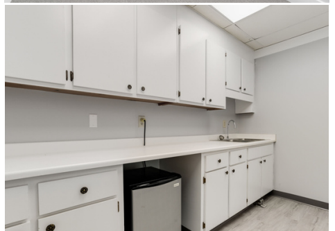
Unit 102: ±1,550 sq. ft. - Contains a large open office area, 4 offices, 1 office is a large executive office that can also be used as a conference room, a kitchen and 2 bathrooms